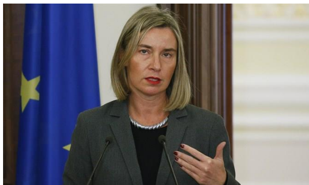
Statement by Federica Mogherini, High Representative of the EU for Foreign Affairs and Security Policy / Vice-President of the EC August 7, 2018

We support the new peace initiative of the Government of Georgia, 'A Step to a Better Future' , aimed at improving the humanitarian and socio-economic conditions of people residing in Georgia's Abkhazia and South Ossetia regions and fostering people-to-people contact and confidence building between divided communities to the benefit of all people.