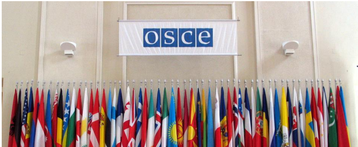
The supplementary item Resolution on “Ten Years after the August 2008 War in Georgia,” 27th Annual Session of the OSCE PA, Berlin, 7-11, 2018

Paragraph 11 states: “Welcomes the new peace initiative of the Government of Georgia - “A Step to a Better Future” , aimed at improving the humanitarian and socio-economic conditions of people residing in Abkhazia, Georgia and the Tskhinvali region/South Ossetia, Georgia, as well as at fostering people-to-people contacts and confidence-building between the divided communities”.