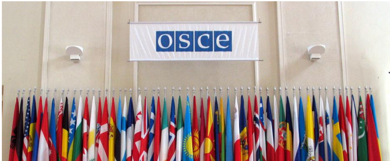
The supplementary item Resolution on “Ten Years after the August 2008 War in Georgia,” 27th Annual Session of the OSCE PA, Berlin, 7-11, 2018

Paragraph 11 states: “Welcomes the new peace initiative of the Government of Georgia - “A Step to a Better Future” , aimed at improving the humanitarian and socio-economic conditions of people residing in Abkhazia, Georgia and the Tskhinvali region/South Ossetia, Georgia, as well as at fostering people-to-people contacts and confidence-building between the divided communities”.