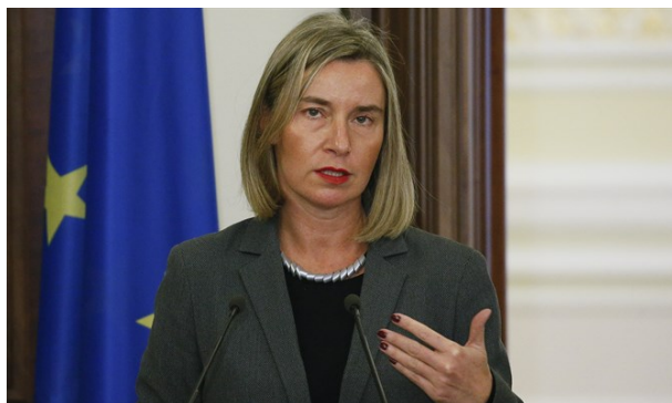
Statement by Frederica Mogherini, High Representative of the EU for Foreign Affairs and Security Policy / Vice-President of the EC August 7, 2018

We support the new peace initiative of the Government of Georgia, 'A Step to a Better Future' , aimed at improving the humanitarian and socio-economic conditions of people residing in Georgia's Abkhazia and South Ossetia regions and fostering people-to-people contact and confidence building between divided communities to the benefit of all people.