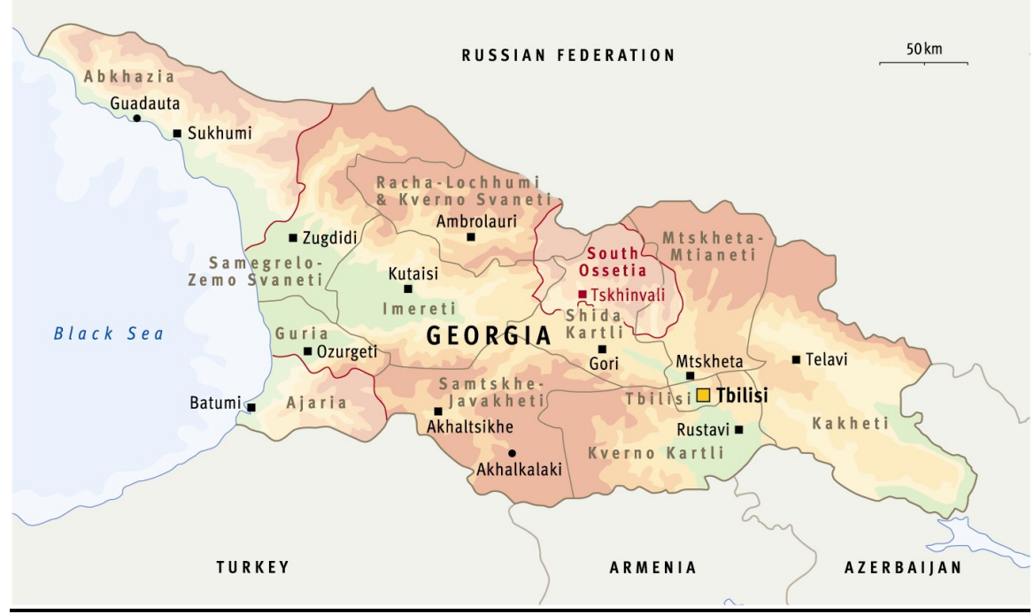
Source: Fischer Weltalmanach, Fischer Taschenbuch Verlag, Frankfurt am Main, 2009